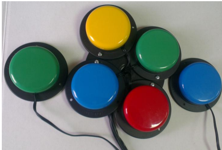
Figure 1: Example of the switches configuration